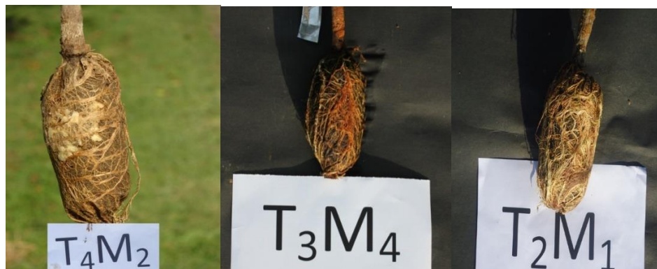
Fig. 1. Fig. 2. Fig. 3.

The air layering seedlings raised were hardened in the tree shade with survival percentage 32.76 per cent. The survival percentage can further be improved provided poly house or mist chamber conditions, due to congenial environmental conditions as compared to uncontrolled environmental conditions of open nursery. This finding is in agreement with the results obtained by Ahmad et al. (2007) in patch budding of walnut, Singh et al. (2007) on Wedge method of grafting in guava ( Psidium guajava ) and Rymbai and Reddy (2010) in air layering of guava ( Psidium guajava ). Production of elite planting material through this technique shall be helpful in increasing lac productivity per tree and thereby increasing income of the farming community.