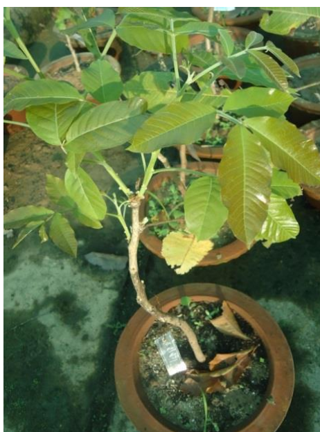
Fig. 6. A seedling raised through air layering technique