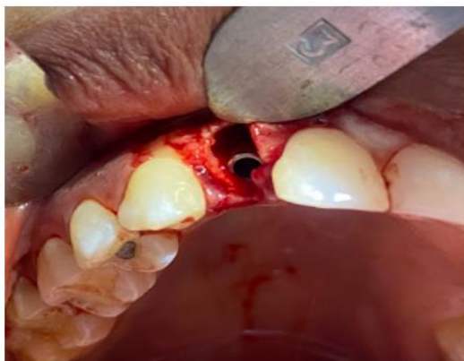
Fig. 2. Implant Installed

In the preoperative period, an impression of the arches was taken to create a surgical guide. The implant installed was the Indexed Morse Taper Wayfit (DSP®, Paraná, Brazil) measuring 3.5 x 15.0 mm, with a torque of 60 N/cm 2 (Fig. 2), enabling the installation of the provisional and activation of the occlusal load.