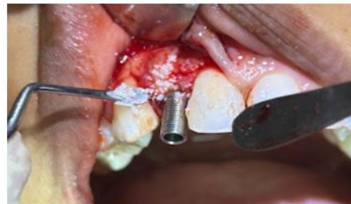
Fig. 3. Installation of the prosthetic component and insertion of bone graft

After installation of the prosthetic component, 0.5 g of bovine bone graft (Lumina-Bone Criteria®, São Paulo, Brazil) was inserted to fill the empty spaces between the implant and the remaining bone (Fig. 3) and the peri-implant soft tissues were sutured.