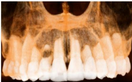
Fig. 1. Initial tomography

A 24-year-old female patient came to the dental clinic complaining of mobility in tooth 12. During the anamnesis, the patient reported having recently completed orthodontic therapy. The tomographic analysis revealed extensive internal resorption with pulp involvement in tooth 12, in addition to resorptions in teeth 13, 11, 21, 22, and 23 (Fig. 1). Therefore, after clinical evaluation, it was decided to perform tooth extraction and implant installation in the region of tooth 12, and to monitor the other teeth, as they did not present mobility.