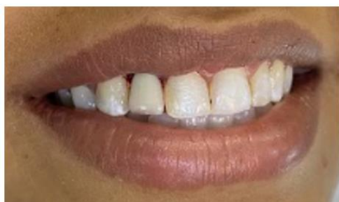
Fig. 5. Final result