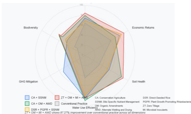
Fig. 3. Integrated assessment of multiple sustainable technologies across productivity, economic, environmental, and social dimensions